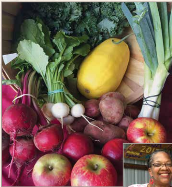
Our collaborative Farm Share supports local farms and provides a healthy bounty to members.