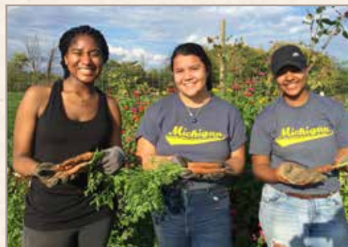
Summer volunteers at The Farm from the University of Michigan.

60% more participants at this year’s Luminary Walk.