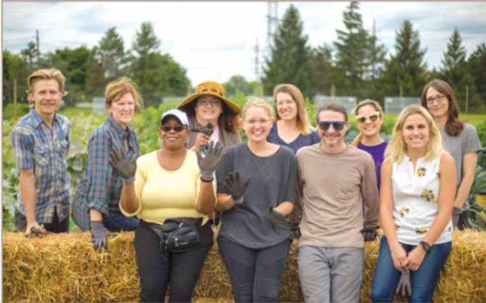
Health Leaders Fellows from the Ecology Center spent an afternoon getting their hands dirty at The Farm.

The Farm continued to be a hub for people to come together to support one another on their paths to better health. We saw this on a small scale at the Staff Community Garden and at a large scale with 60% growth at the Luminary Walk.