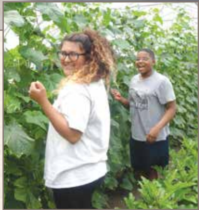
Upward Bound teens reported that gardening helped them to relax and de-stress this summer.

79% of field trip students tried a new fruit or vegetable while at The Farm.