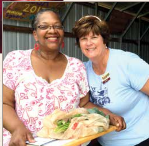
Farm Share members picking up their bags during the summer season.

67% more pounds of fruits and vegetables harvested this year.