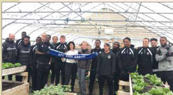
AFC Ann Arbor soccer players show off gloves donated by Ace Barnes Hardware.