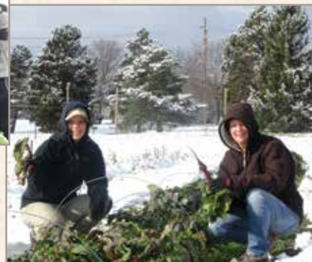
Volunteers harvest year around and even through the cold to keep The Farm going strong.

Please help us continue to grow by supporting The Farm with a gift of time or money.